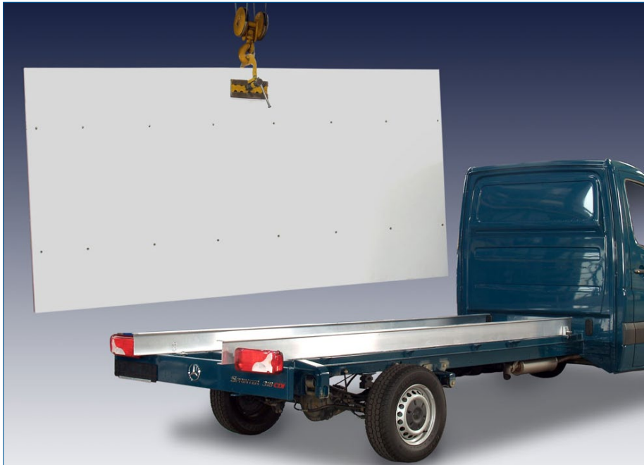
for normal chassis-heights