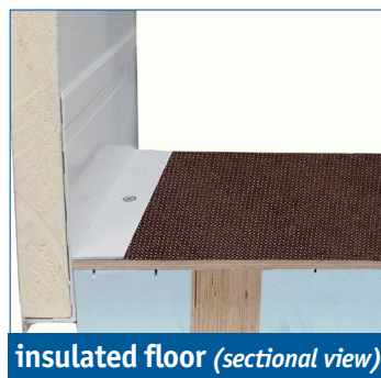
insulated floor ( sectional view )