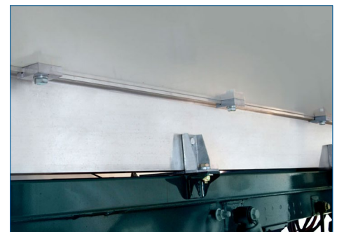
connecting soil using clamping clamps