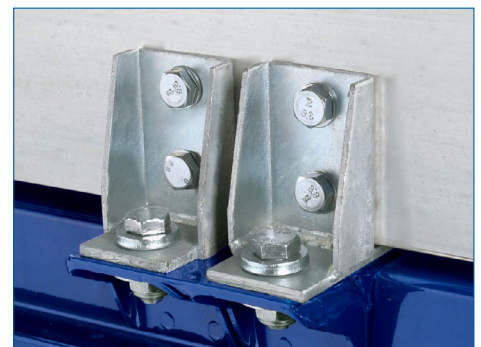
fastening of the longitudinal beams on the chassis