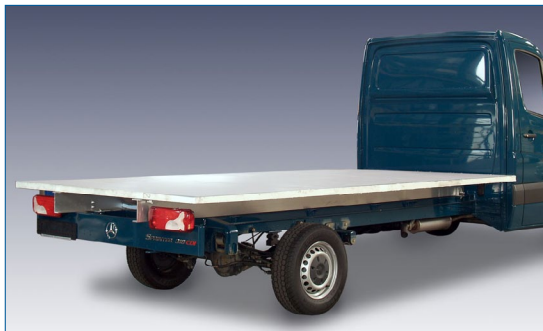
with aluminium longitudinal beams ( not required for low frames chassis )